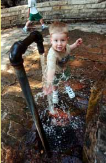
Mississippi Palisades State Park

“We come and go, but the land is always there.