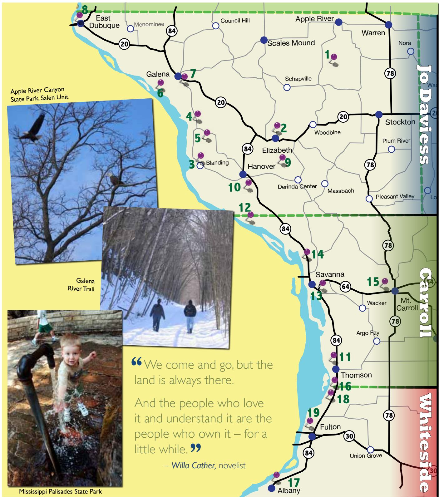
Apple River Canyon State Park, Salen Unit